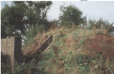
EARTH COVERED NISSEN TYPE HUT

From Verwood and Three Legged Cross Official Guide, 1995